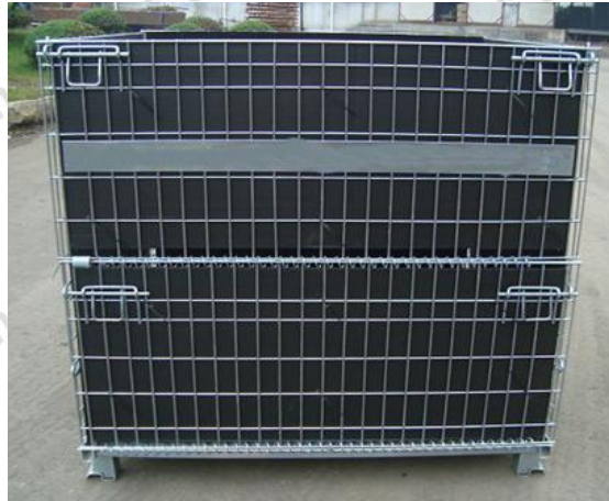
With PP sheet design