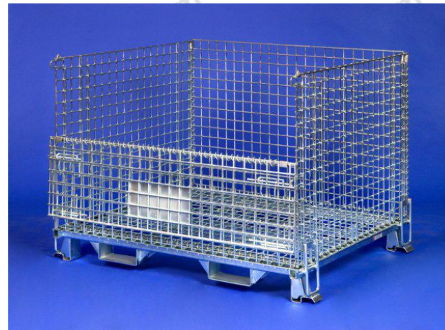
With 4 small forklift channels design