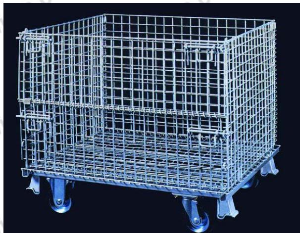
with casters design