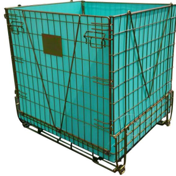
PET Prefrom container