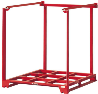
Stack pallet rack